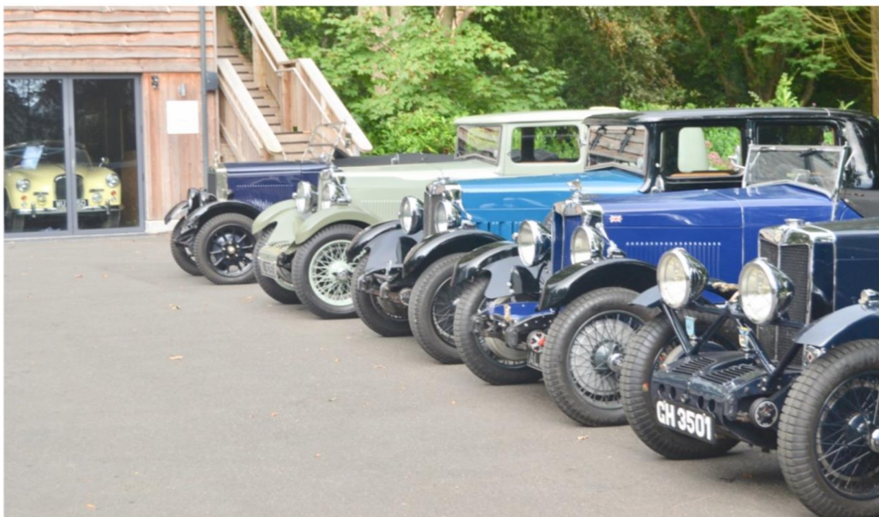
The Deer Park has a collection of cars available for wedding hire, such as the yellow Alvis.