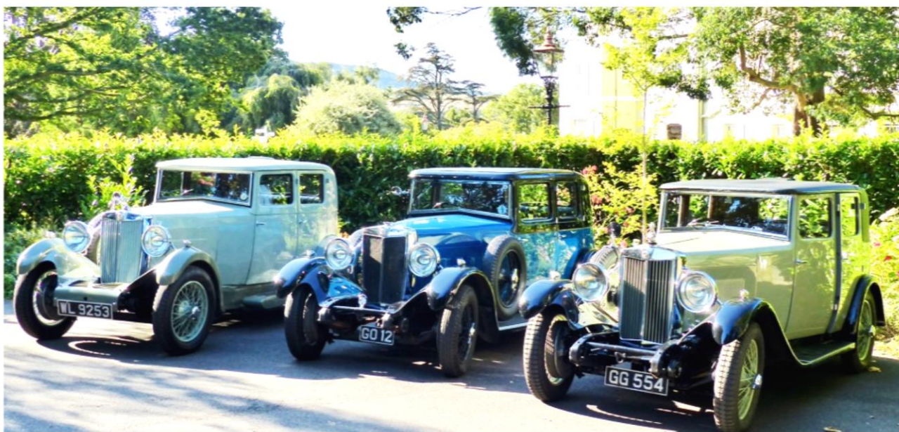
A rare occurrence – all three surviving 18/80 Mk II Saloons together.