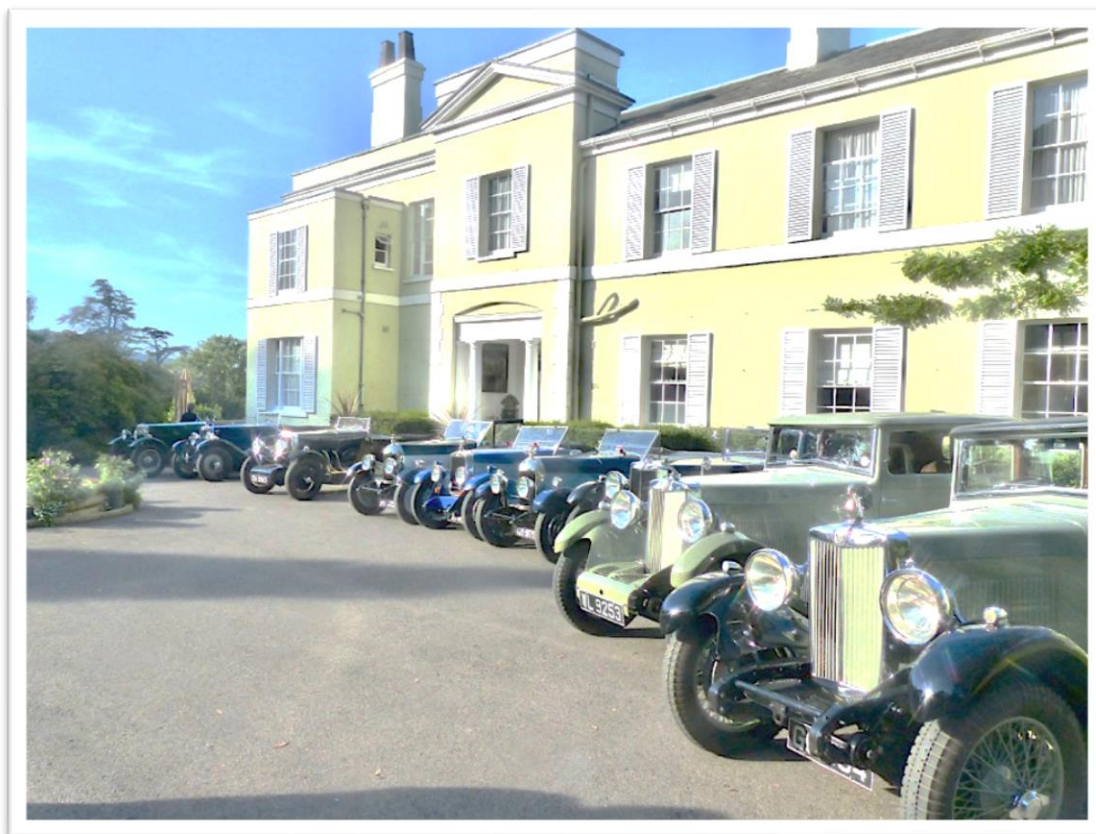
An impressive line-up at the Deer Park.

Chas Howe organised the superb event and arranged some interesting outings over typically narrow and steep Devon roads. A full report will feature in a future edition of our magazine, but for now, here are some pictures taken at the event.