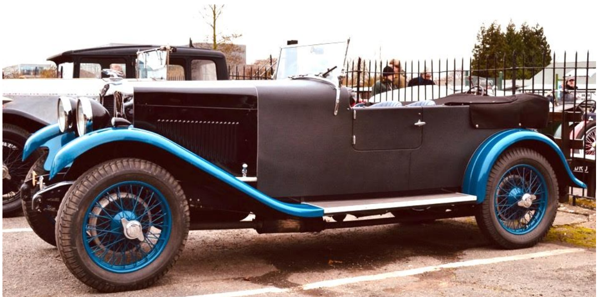
WL 7125 parked in the paddock at Brooklands.