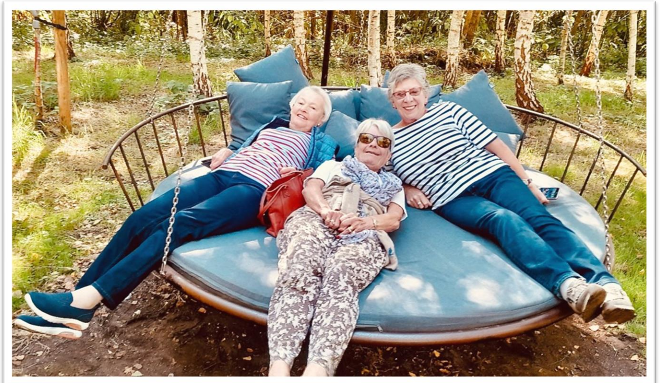
How to enjoy a sculpture!