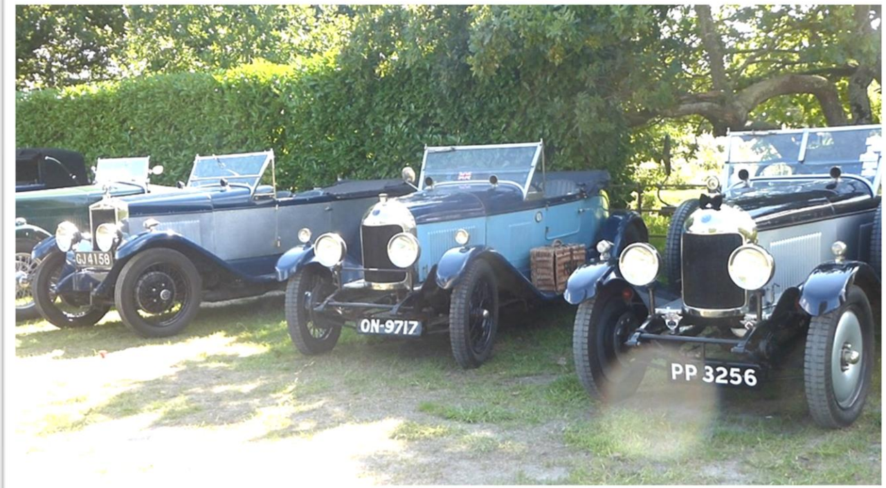
“Three Fours” at Sculptures by The Lakes, near Dorchester.