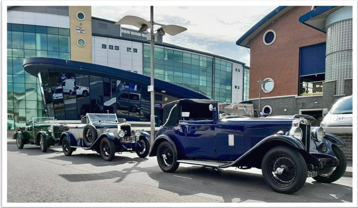
The cars arrive for our visit to the RNLI Centre in Poole.