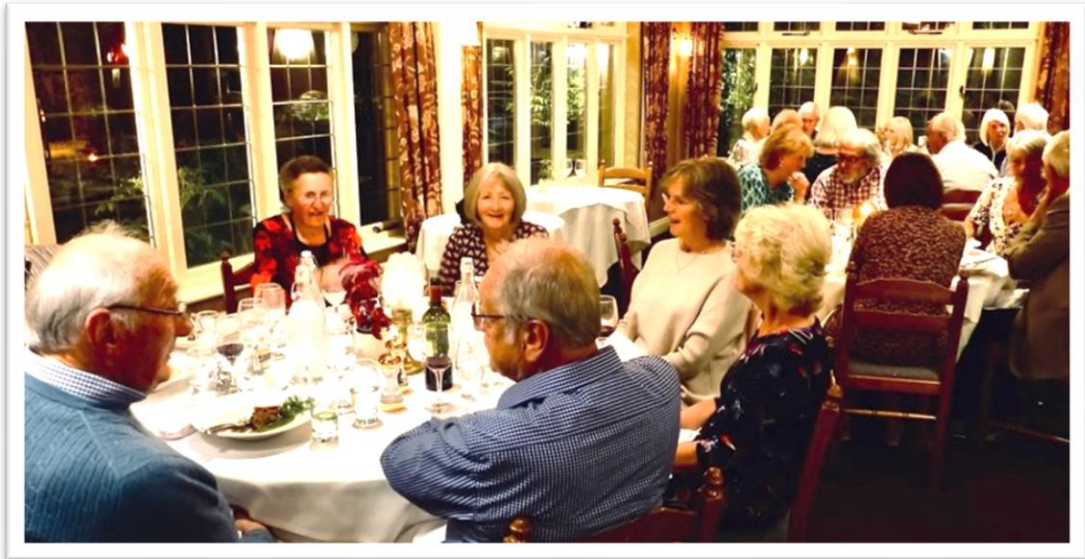
Feeding time at The Grange.