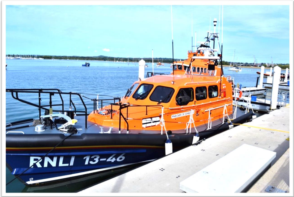
The latest addition to the rescue fleet – The Duke of Edinburgh.