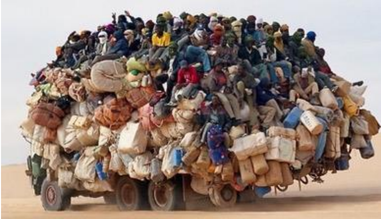
You can get around by road ...

Here are two pictures left over from last month, when the Memsahib and Scribe had just returned from a trip to Rajasthan, showing some typical local transport systems :