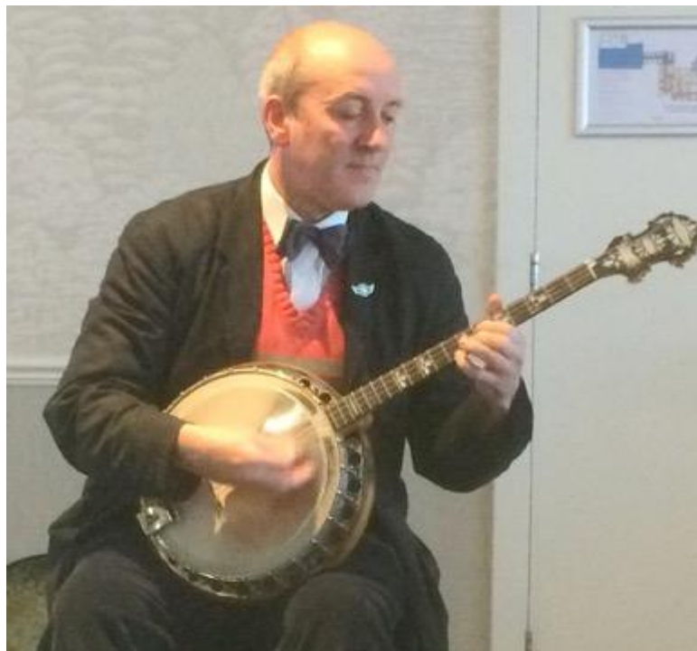
... and finished with some outstanding banjo numbers – including by request, a rousing encore!