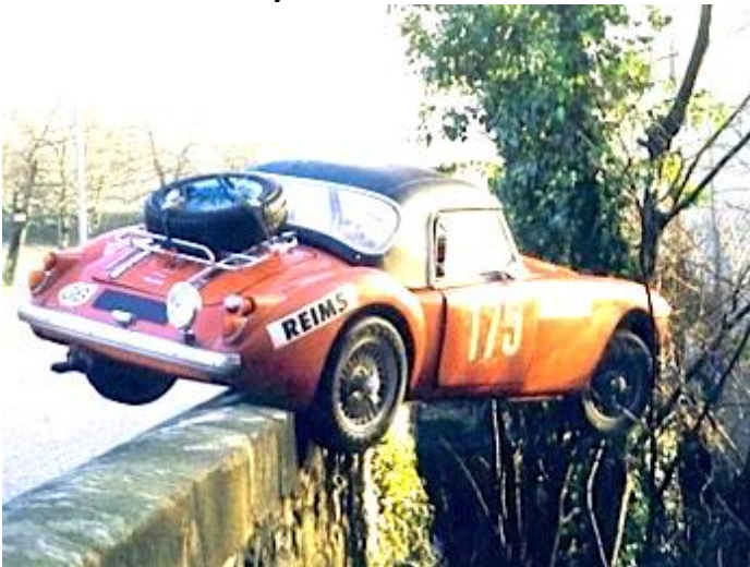
... so do Drive Safely.

If you're out and about in your M.G. in the UK, don't forget that a frosty road can still catch you out at this time of year :