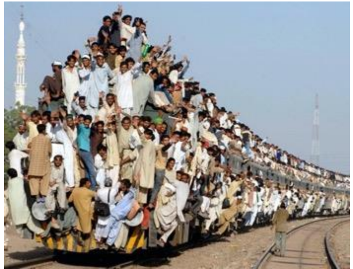
... or by rail.

If you're out and about in your M.G. in the UK, don't forget that a frosty road can still catch you out at this time of year :