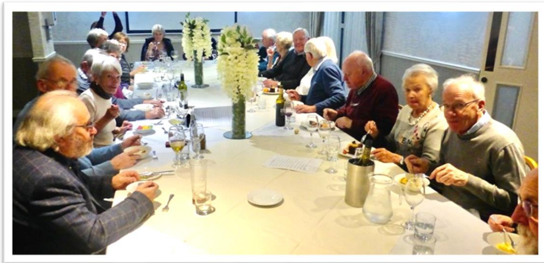
... and at dinner on the evening before the AGM.