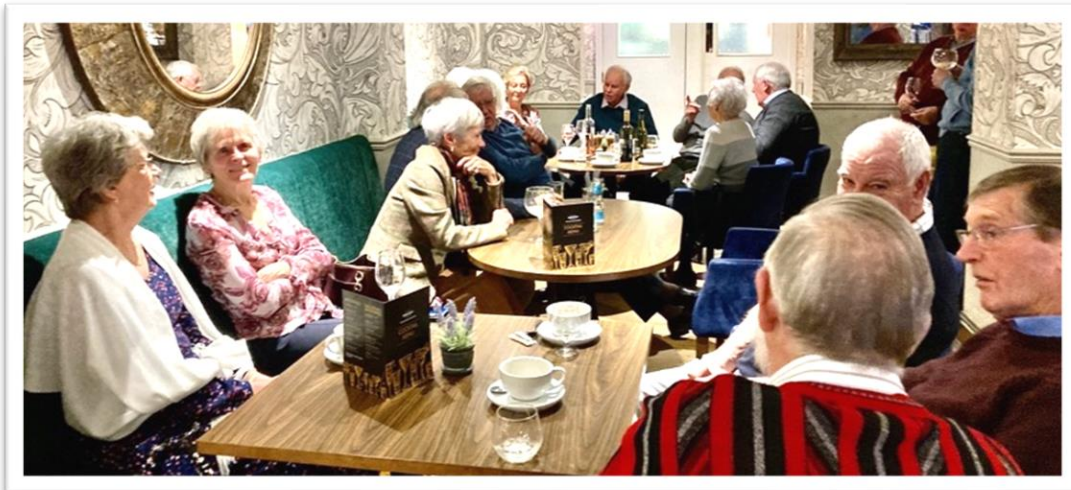
Gathering in the bar at The Lambert Hotel ...