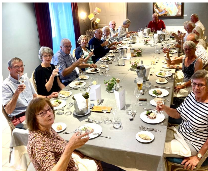
Team feeding time at Hotel l'Ermitage, Saulges