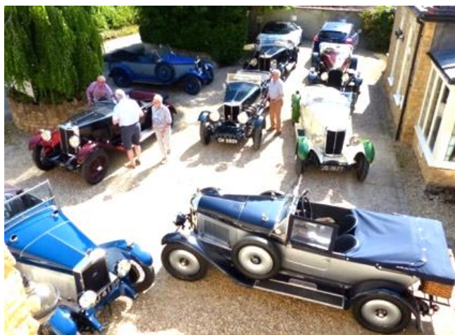
EMGS 25 th Anniversary at The Grange in 2017.