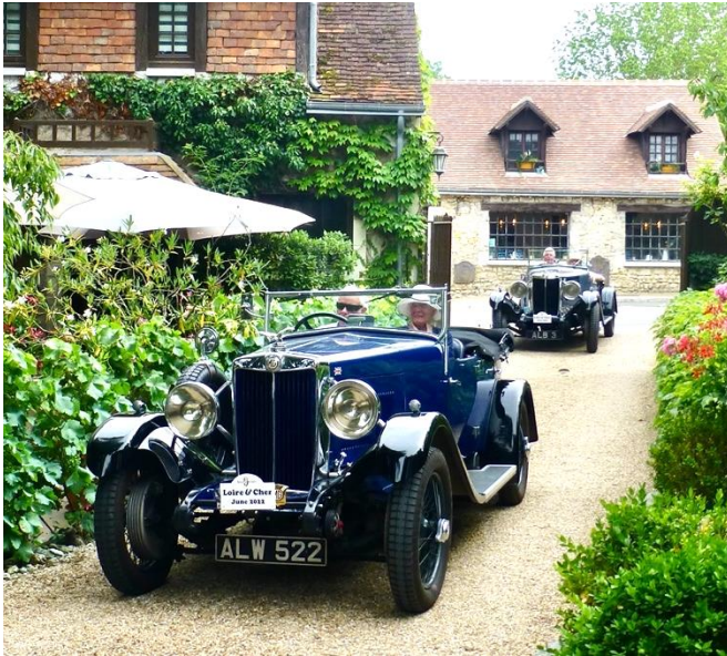
Arriving at Auberge du Bon Laboureur, Chenonceaux