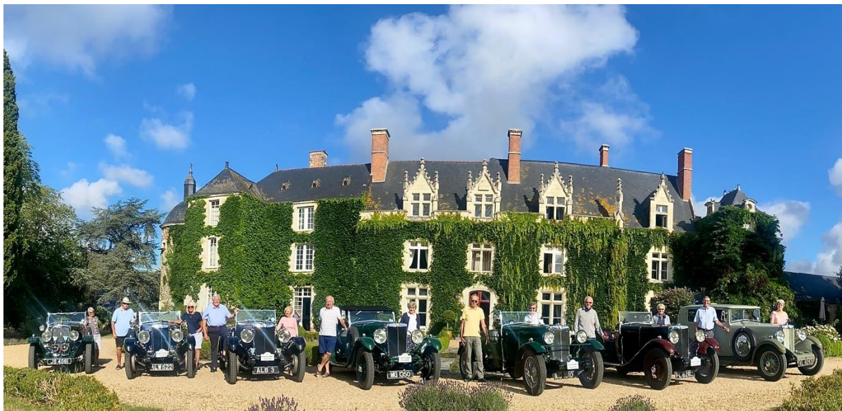
At the first hotel destination – Chateau de l'Epinay, near Angers.

A few more scenes from the recent Loire & Cher trip.