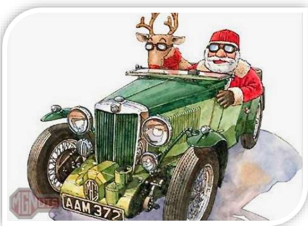
Not technically an “Early M.G.” but close enough for Rudolph!

Happily, Chas has almost fully recovered – but nine months later, he is still not quite back to full strength. If anybody ever doubted the dreadful effects of the virus, they should ask Chas or Sue.