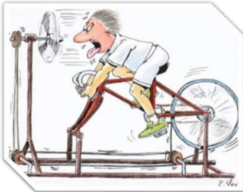
The fitness training bicycle with automatic air-conditioning.

Staying on the theme of Christmas presents – here are a couple of suggestions for the man who has everything: