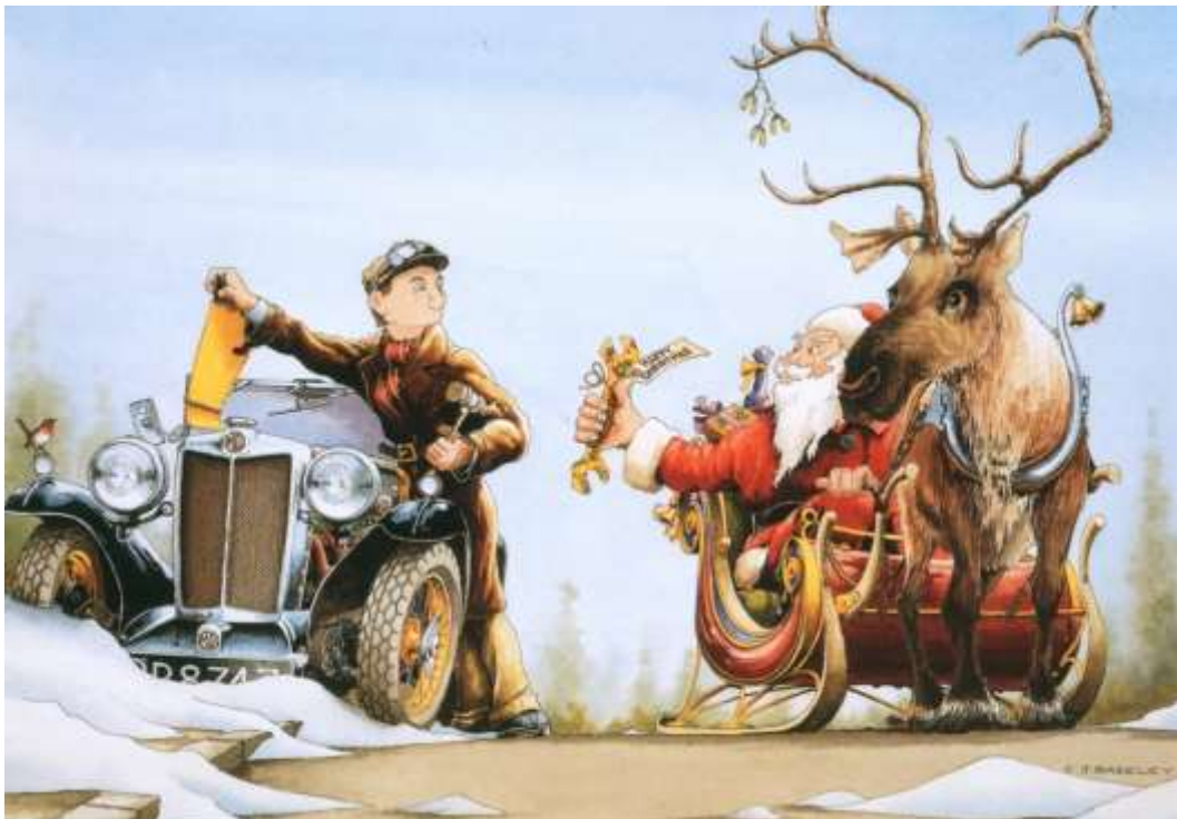
Santa delivers one of those new wrenches in the nick of time.